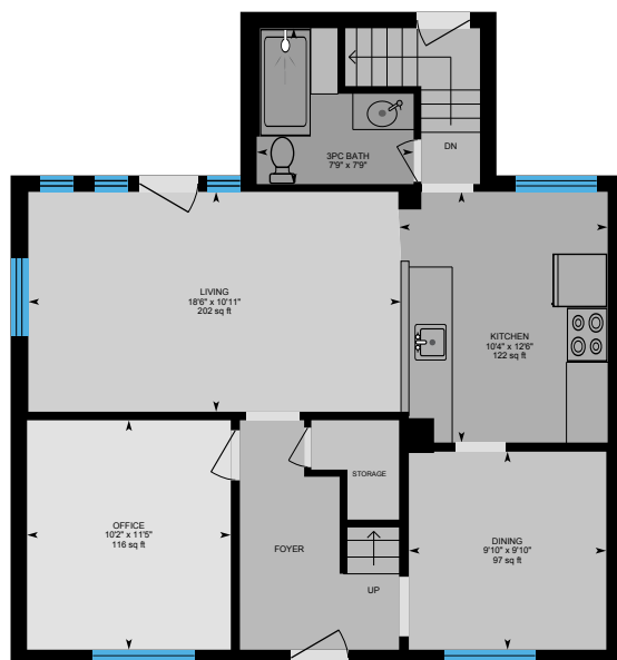
Main Floor Exterior Area 846.65 sq ft

Main Building: Total Exterior Area Above Grade 1473.76 sq ft