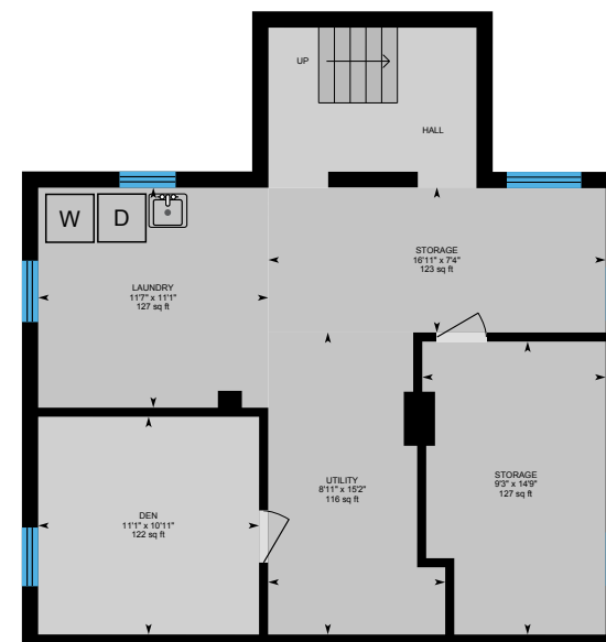
Basement (Below Grade) Exterior Area 824.48 sq ft